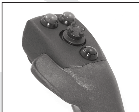
Thumb operated T4 mounted in G3 Grip

Note: For further information on the extensive range of Toggle & Trim Switches available, or for assistance with your specific requirements, please contact us.