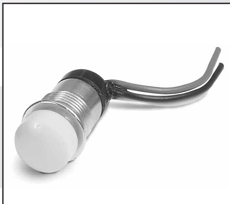
HP7 Hall Effect Pushbutton switch