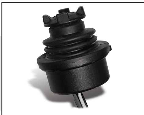
HTL-4 Hall Effect 4 way Mini Trim toggle